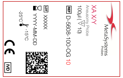
Chromosomes X, and Y